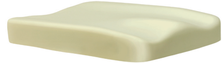
Polyurethane foam, anatomically shaped

Product Weight: 1.5 Lbs / 0.68 Kg (16"W x20"L)