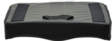
Non slip Bottom on washable, incontinent cover