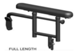
FULL LENGTH HEIGHT ADJ. FLIP BACK