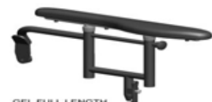
GEL FULL LENGTH HEIGHT ADJ. FLIP BACK