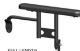
FULL LENGTH FIXED HEIGHT FLIP BACK

D. For front seat to floor of 14" and above the long fork is used