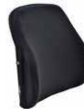
Prism Basic Back with 3" laterals