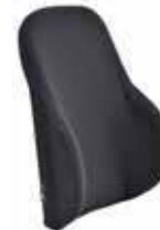
Prism Ultra Back with 6" laterals