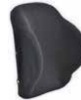
Prism Max Ultra Back with 6" laterals