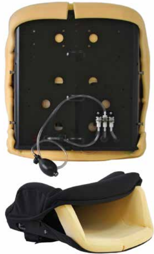
Cover and Foam Layers, showing depth of the back