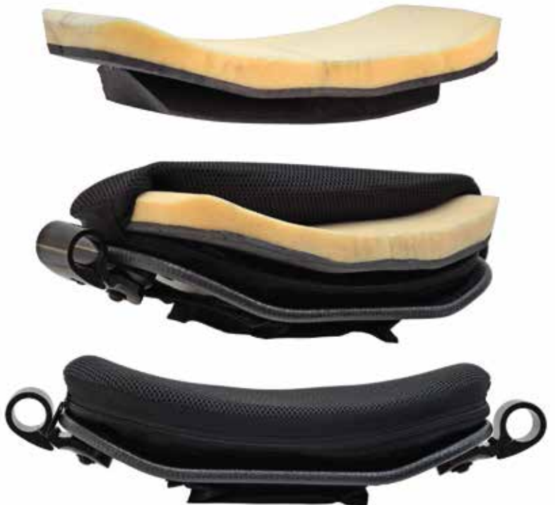
Cover, Foam Layers and Aluminum Hardware